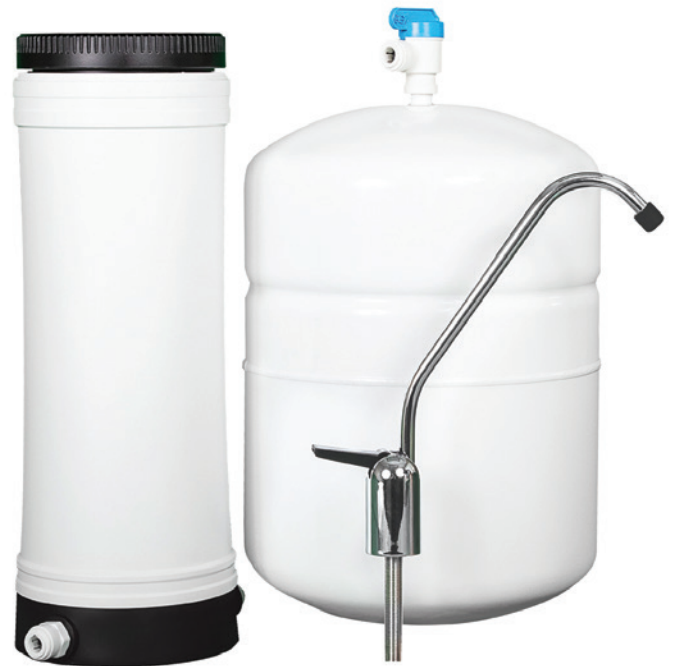
Solo I Reverse Osmosis System

The system includes a 3.2 gallon pressurized white metal storage tank, long reach faucet, tubing, and all the necessary fittings and hardware for a quick and easy installation.