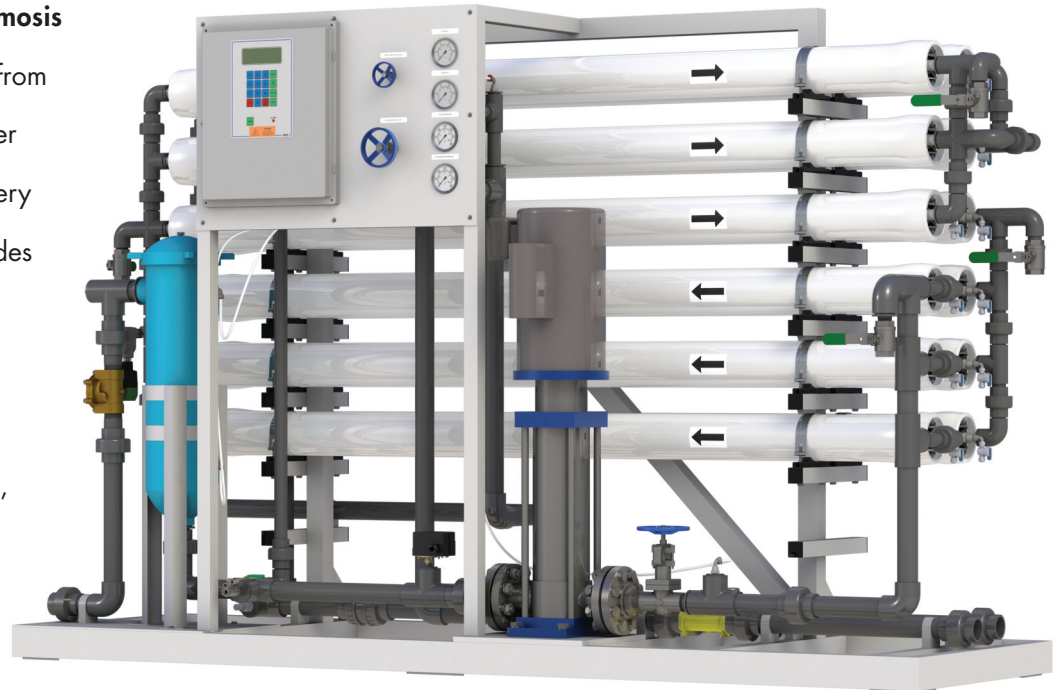
M1 – 12240 Reverse Osmosis System

These systems can be upgraded with features such as a variable frequency drive, digital instrumentation, a chemical feed system, blending valve and a permeate divert valve.